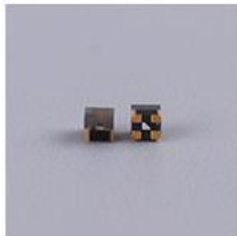
SMD 0404 RGB LED