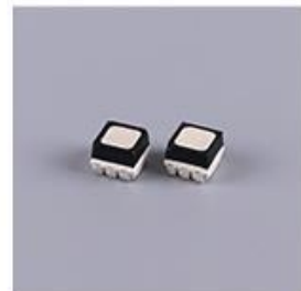
SMD 3535 RGB LED