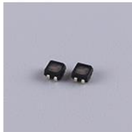
SMD 1515 RGB LED