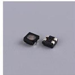
SMD 2020 RGB LED